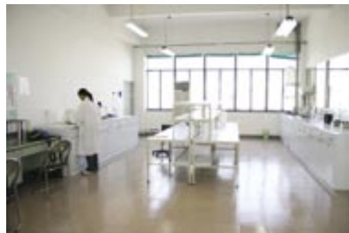
Chemical characterization laboratory in Shanghai, China.

Finally, applications for our sensors are being added monthly in places like Shanghai, Beijing, and Hongzhou, China. Japan and Korea are also pages in the ASI portfolio. Why not though? Like the song at the theme park said "it's a small world after all, it's a small world after all, it's a small, small....."